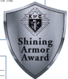
Lapel Pin (#1700)